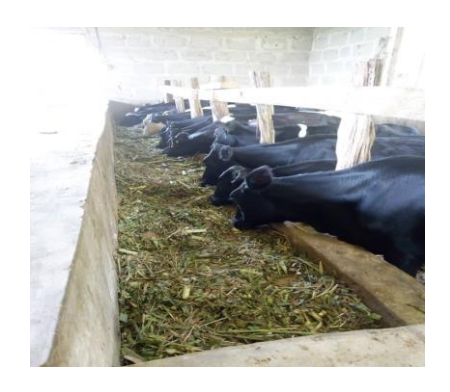
Figure 3: Dairy cows feeding on maize silage