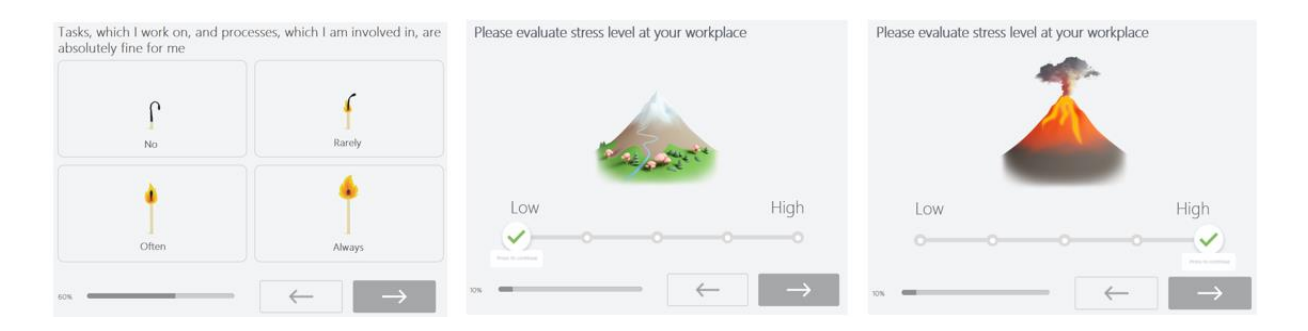
Figure 2: Elements of gamification in Happy Job surveys: card-choice question and slider

Types of questions vary – participant are invited to choose one of the answer options, rate or evaluate different aspects of their work. Another distinctive feature of Happy Job methodology is gamification of surveys, which is not provided by other online engagement evaluation tools. As it was mentioned in the previous section, gamification allows gaining more transparent and reliable results of assessment due to higher respondent involvement. Among the elements of gamification used by Happy Job application there are progress-bars, sliders, star ratings, animated pictures. Example of entertaining questions with gamified elements is presented by the Figure 2.