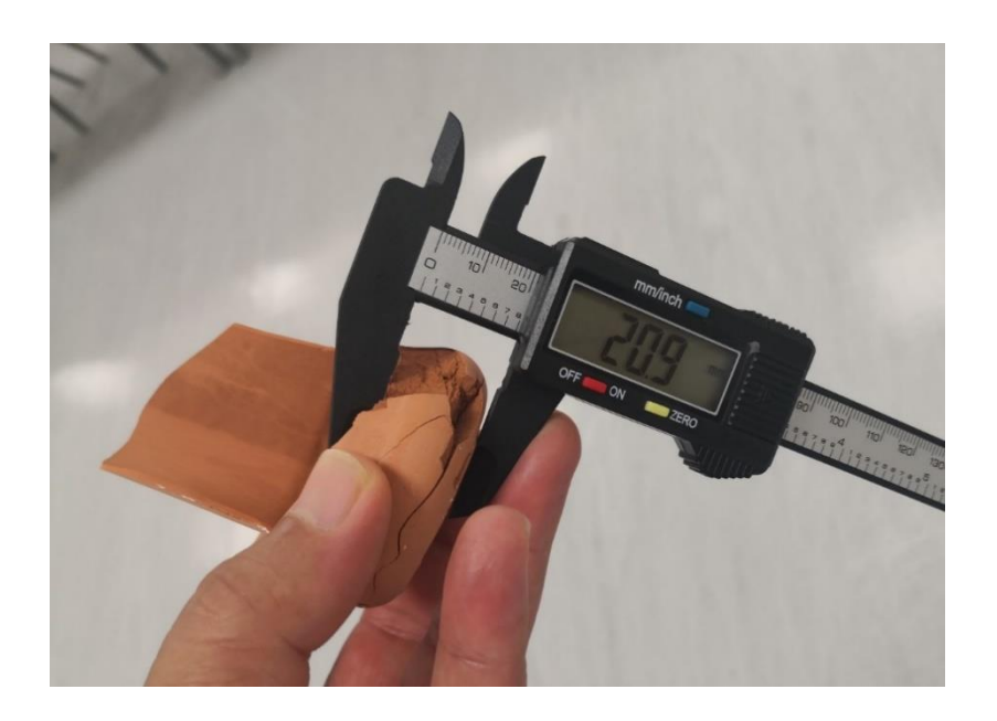
Figure 4: First test of the ACTP clay (slip) showed the defect of settling in the bottom of the mold, so the extracted piece of ceramic had a very thick bottom (SQU-Ceramics Lab).

4). The first step was to isolate the defect of settling by measuring the specific gravity of the slip. This allowed the researcher to determine if the issue was with the percentage of water or the deflocculant in slip.