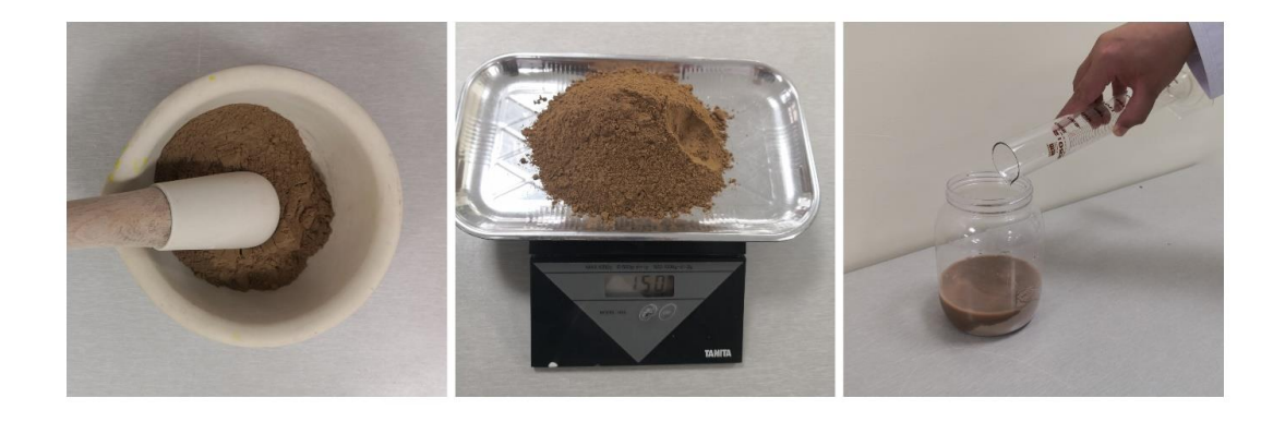
Figure 1: Laboratory preparation stages of (A) grinding, (B) measuring, and (C) mixing (SQU-Ceramics Lab).