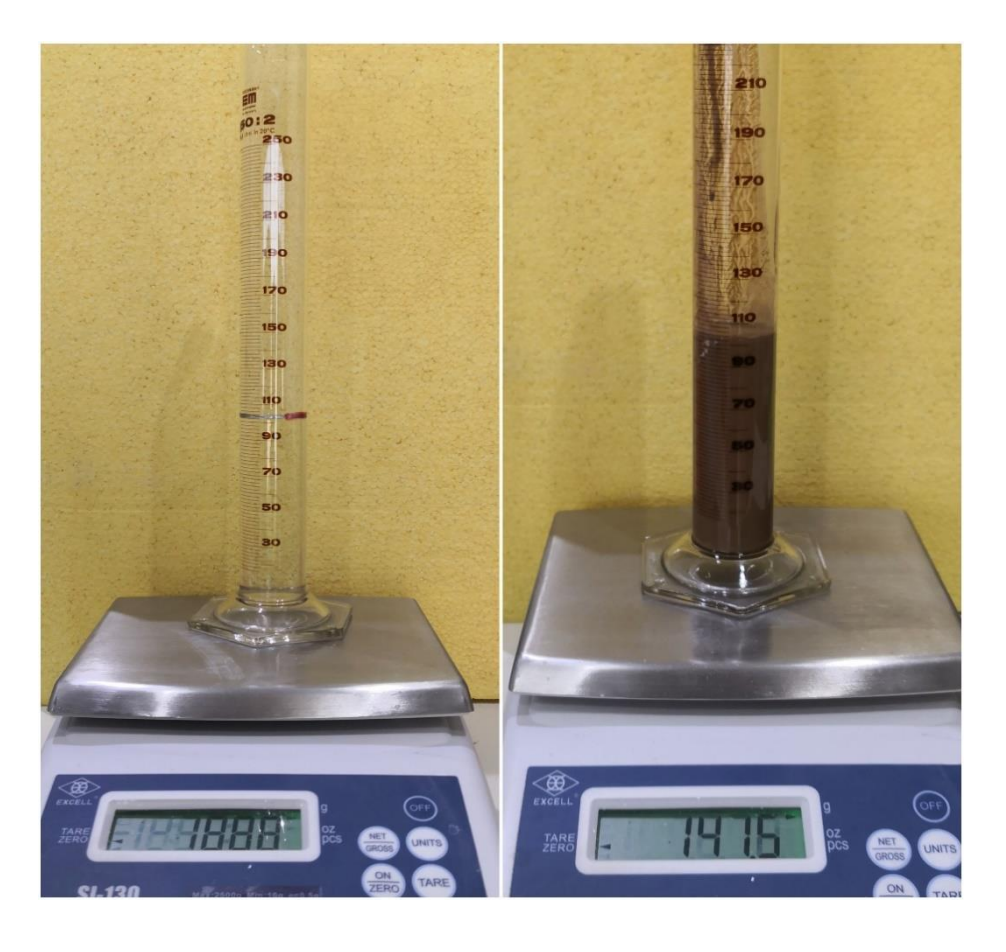
Figure 5: Measuring specific gravity of the ACTP clay slip (SQU-Ceramics Lab).