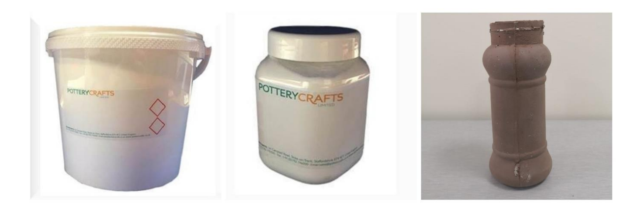
Figure 3: Second test with deflocculants, including (A) sodium silicate, (B) soda ash, and (C) the extracted casted piece (SQU-Ceramics Lab).