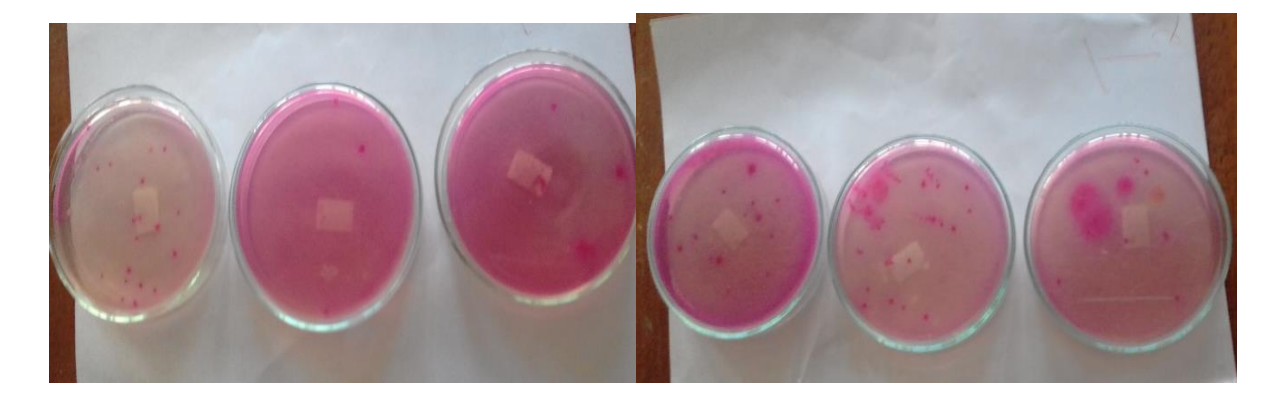
Figure 1: T1 treated with concentrated extract

Table 2: Number of Lactobacillus Colonies against the Concentration of Garlic Extract Treatment