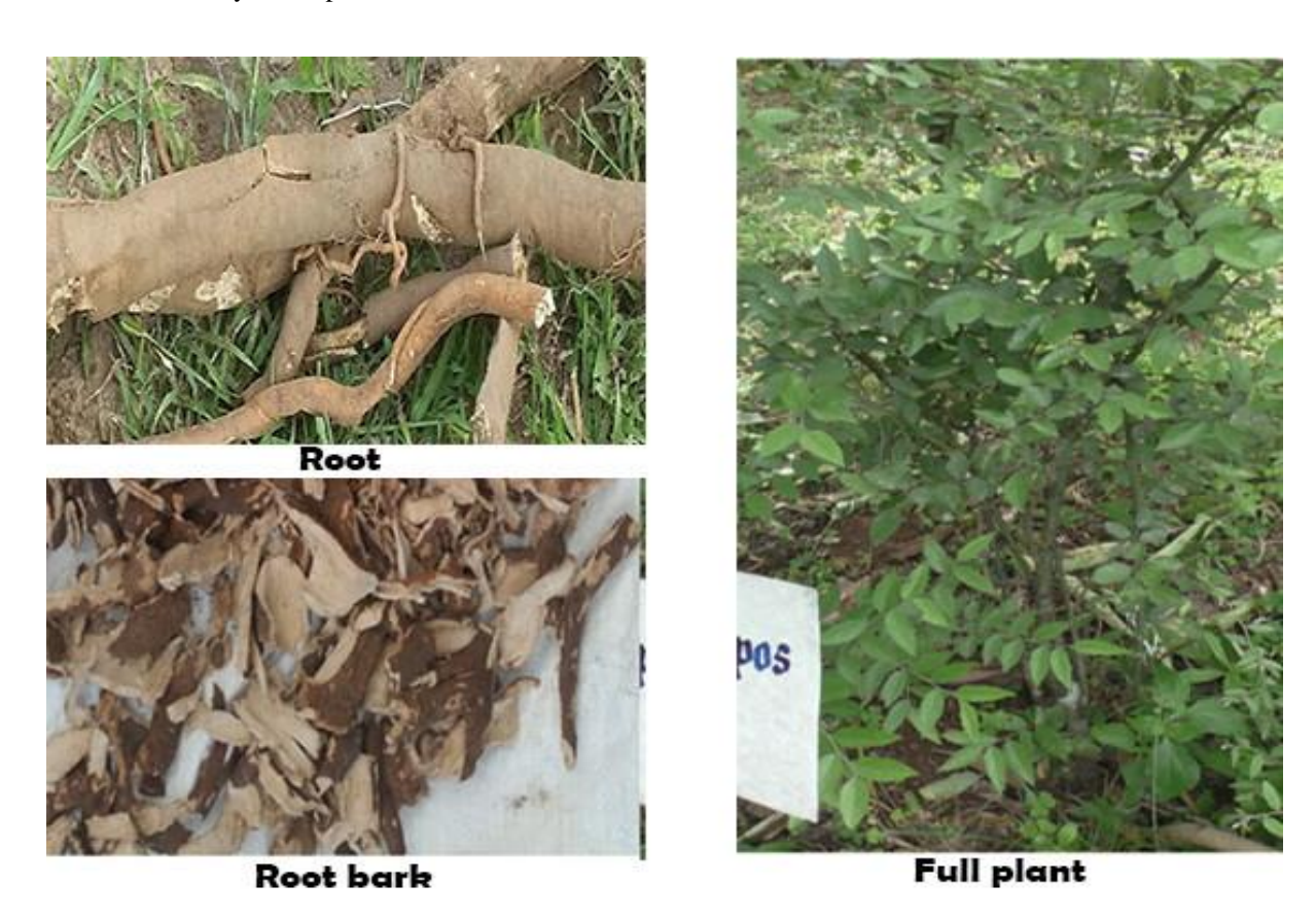
Figure 1: Pictures of root, root bark and full plant of C. erythrocarpos .

C. erythrocarpos is usually described as a scandent shrub or climber, armed with sharp, paired hooked thorns (Figure 1). Branches slightly zigzag, greyish-velvety when young. The stem of the plant can be described as weak, light green when young and brown when old. The leaves are fleshy with a glossy appearance. The striking difference between the young and old leaves is the light green lanceolate shaped young leaves as opposed to dark green elliptical to ovate old leaves [28]. The leaf base is cuneate to rounded. The apex is sharply acuminate to obtuse with dimensions of 3-14 cm long and 1.5-5 cm broad. Its flowers or stout pedicels (2-2.5 cm long) are clustered at the end of a leafy shoot, petals are mostly emarginated, ovary ribbed and the fruit scarlet is 5 cm long [21]. The flowers are solitary, axillary, white in colour but often pink at the base of the stamens. Iner sepals are petaloid greenish white, 3-4 times longer than outer sepals [29]. Stamens 40-50, up to 2.8 mm long [29]. Fruits ellipsoid, 4 \times 2.5 cm, strongly 6-8 ridged and deep-pink when ripe (Figure 2) [29]. Seeds are brown in colour and usually 15-20 per fruit.