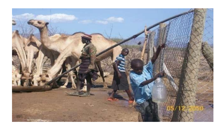
Figure 4.2: Turkana Pastoralist with his camels drinking water.