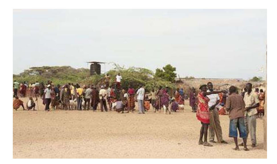
Figure 4.3: Livestock Market.