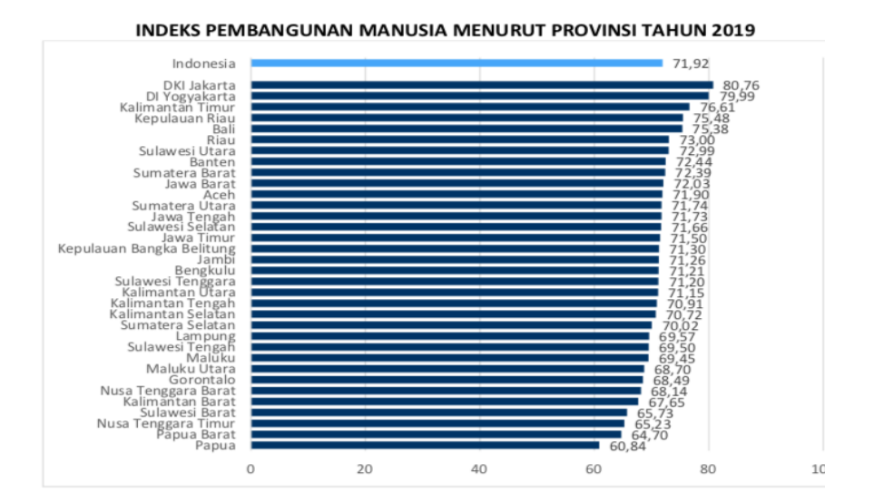
Figure 3: Human Development Index by Province

lower than Indonesia's average HDI (71.92) [2].