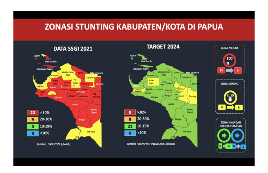
Figure 1: Stunting Zoning of Regency/City of Papua Province

According to SSGI 2021 statistics, there are still 20 districts with a stunting prevalence of more than 30% and 9 districts with a prevalence of 20-30%.