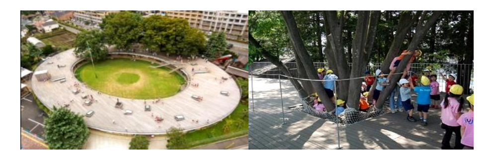
Figure 4: The oval-shaped form of the kindergarten (on the left) - The three Zelkova trees favorable for children to climb (on the right).

Table 5: Biophilic design principles in Fuji Kindergarten.