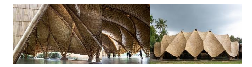
Figure 1: Different views of the bamboo structure of the green school.