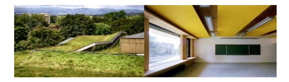
Figure 2: The plant-covered rooftops and its integration with the natural environment in Lyon (on the left) - the floor to ceiling windows and its effect on the natural day lighting in the classrooms (one the right).