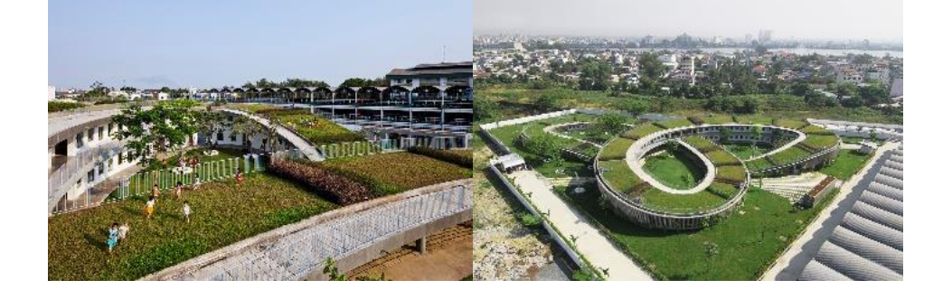
Figure 3: The Kindergarten accessible roof (on the left) - Ariel view for the building roof (on the right).

Table 4: Biophilic design principles in Vo Trong Nghia's Farming Kindergarten.