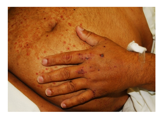
Figure 1: Scattered purpuric rash on the patient's chest and abdomen (2)