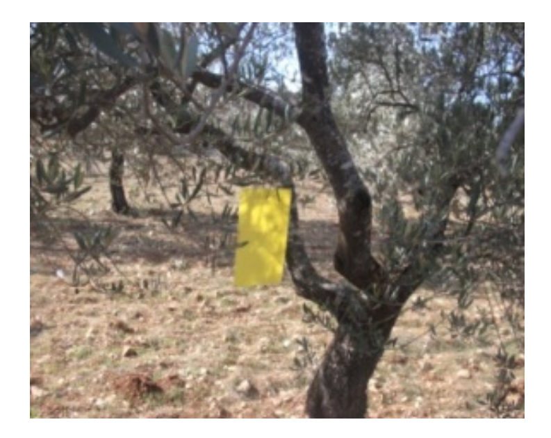
Figure 1: Yellow colored sticky trap

To monitor the flight activity of olive fruit fly, an experiment was carried out in the olive grove from 1st July 2012 - 30th October 2013. Four traps were used, each constituted yellow colored sticky rectangular posterbroads 15*25 cm dimension (Fig. 1). One side of the board was painted with adhesive (sticky) paste, which is Rinifoot® (Polisobutene 80%). Traps were hanged on randomly selected trees (one in each block in the olive grove) at a height of 1 to 2 m. The sticky board were weekly monitored, exchanged, and took back to the laboratory where, the captured olive fruit flies were counted and sexed under binocular microscope.