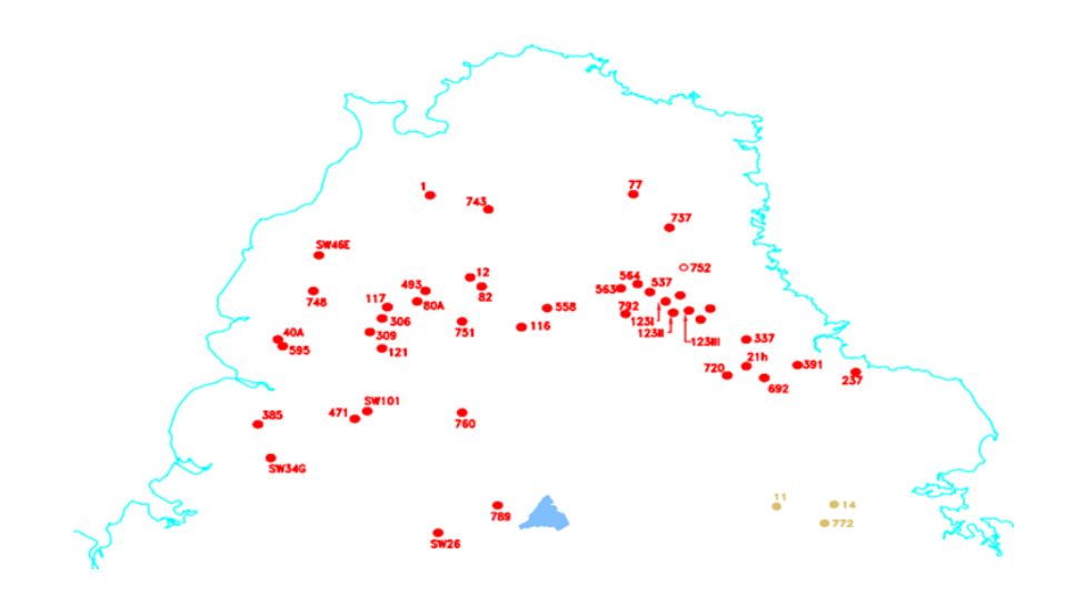
Figure 2 : Map showing location of boreholes with number