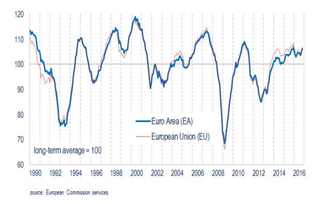
Figure 1: Consumer Confidence indicator

Overall, In October 2016, the European Commission, estimate1 of the consumer confidence indicator2 remained broadly unchanged in both the EU (-0.1 points to -6.5) and the euro area (+0.2 points to -8.0) compared to September 2016.