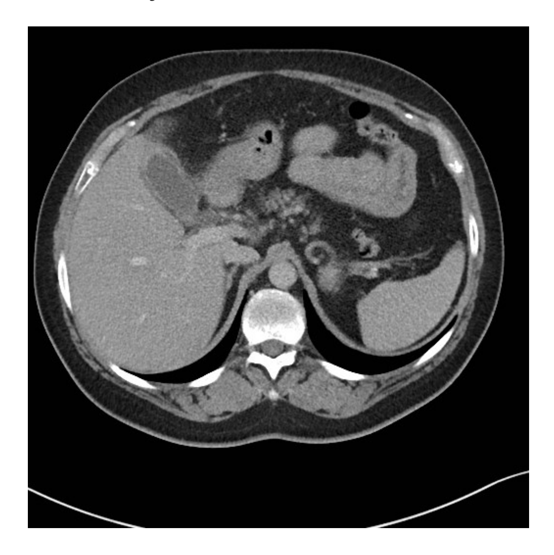
Figure 1: Computed tomography of the abdomen findings: acute cholecystitis.

two previous colonoscopies had been uneventful. On the current admission she was found to have sessile polyps in the descending colon which were resected and retrieved for histology. She was discharged on the same day. She represented to hospital 24 hours later with lower abdominal pain and vomiting. She denied any previous history of biliary colic and was not known to have gallstones. Examination revealed a soft but tender abdomen with guarding in the lower abdomen. She was not tender in the right upper quadrant and was murphy's negative. Laboratory tests revealed a normal white cell count of 7 000 mm²; total bilirubin 14 umol/L; gammaglutamyl transferase 38 IU/L: alkaline phosphatase 60 IU/L. She underwent a computed tomography of the abdomen and pelvis to rule out a bowel perforation. This surprisisingly revealed gallbladder wall thickening, pericholecystic fluid and fat stranding around the gallbladder. There was no pneumoperitoneum. An Ultrasound scan of the abdomen also showed cholelithiasis, 4mm thick gallbladder wall and pericholecystic fluid. The discrepancy between radiological findings and clinical examination resulted in the patient being admitted into hospital for observation. She went on to develop right upper quadrant pain overnight and fevers. She had a laparoscopic cholecystectomy which revealed a gangrenous gallbladder. The specimen, in addition to histology, was also sent for culture which grew E. Coli.