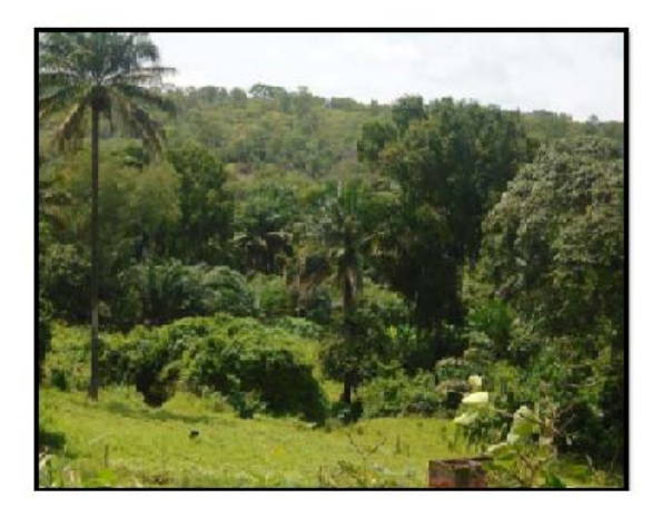
Figure 4: Forest as a Source of Fuel Wood at Yelwa Village