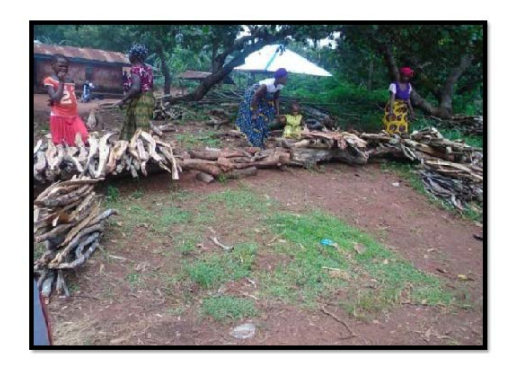
Figure 5: Fuel Wood Selling Point at Yelwa Village