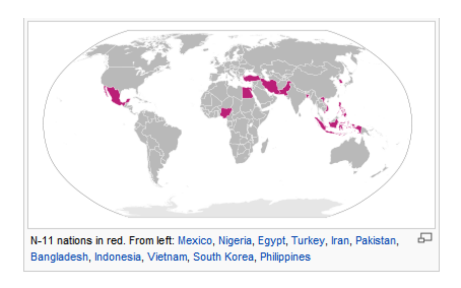
Figure 1: N-11 Countries

The Next 11 ( N-11 ) is a list of fast-growing countries identified by Goldman Sachs as potentially good investments in the coming years. These countries are Vietnam, South Korea, Turkey, Philippines, Bangladesh, Indonesia, Egypt, Iran, Nigeria, Pakistan and Mexico. The bank picked these countries all with promising standpoints for investment and future development. The criteria used by Goldman Sachs were the political maturity, macroeconomic stability, investment policies and openness of trade, political maturity,