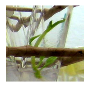
Figure 2: Regenerated plant of Irad 2005 four weeks after meristem culture

range test at p = 0.05. Four weeks after culture, the variety Irad 2005 regenerated plants with the highest mean plant height of 1.25 cm (Fig. 2.). This was followed by the varieties Cipira and Bambui wonder with a mean plant height of 1.13 cm. The least mean plant height of 0.9 cm after four weeks was observed with the variety Tubira. The six improved varieties showed no significant difference at p = 0.05 among varieties (Fig. 3).