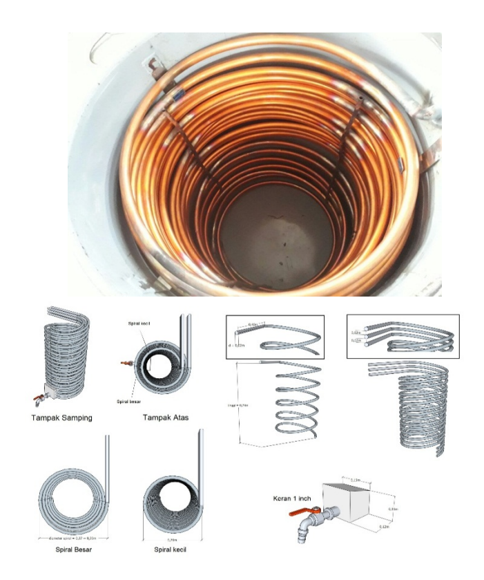
Figure 1: Design of Liquid Smoke Destilator