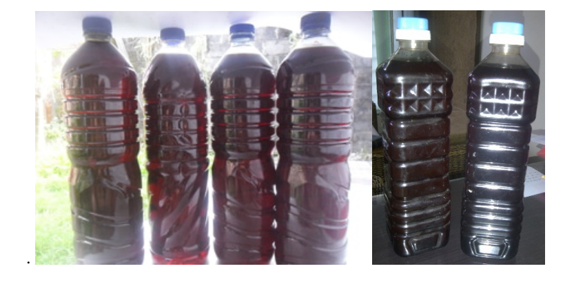
Figure 3: Liquid Smoke Packaging

Liquid smoke that has been accommodated in jerry cans that have been separated according to each gradenya, then packed and labeled. Liquid smoke packaging according to customer demand based on grade and amount of liquid smoke ordered, if no order is only stored on jerry cans. However, until now, the resultant smoke from the new rice husk combustion can produce grade 3 liquid smoke. Liquid smoke packing can be broken down into 500 ml sizes up to 2,000 ml