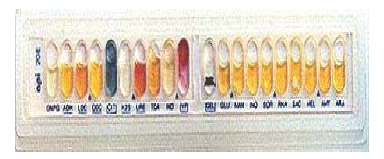
Figure 2: API-test strip for the identification of enteric pathogen.

The swab containing MacCartney bottles were transported to the Microbiology Laboratory of Adekunle Ajasin University, Akungba-Akoko and incubated at 37<sup>o</sup>C for 24hrs. The rinsed fluids were subcultured on MacConkey agar and Blood agar and incubated for 24hours at 37<sup>o</sup>C. Bacterial isolates were first differentiated by macroscopic examination of the colony based on size, colour, pigmentation, elevation surface texture, and margin, haemolysis on blood agar and lactose fermentation on MacConkey agar [14]. The API-20E test kit (from bioMerieux, Inc.) was used to identify the enteric gram negative rods