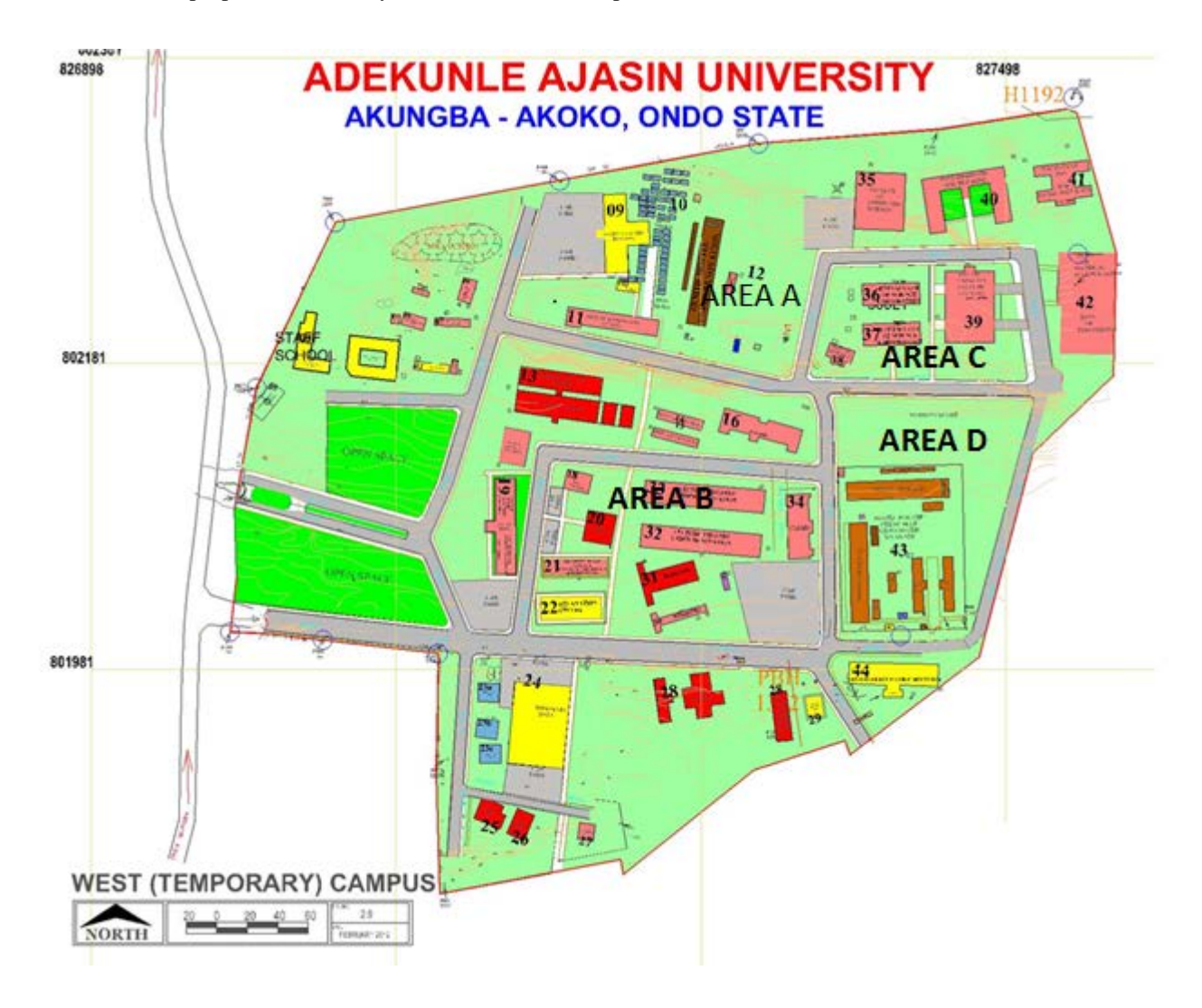
Figure 1: Map of the Temporary site of Adekunle Ajasin University, Akungba Akoko Ondo State, Nigeria

The study was carried out at selected public toilets in Adekunle Ajasin University, Akungba-Akoko. The university community has close to 10,000 students in population. The entire University community is divided into four, for the purpose of this study as indicated on the map.