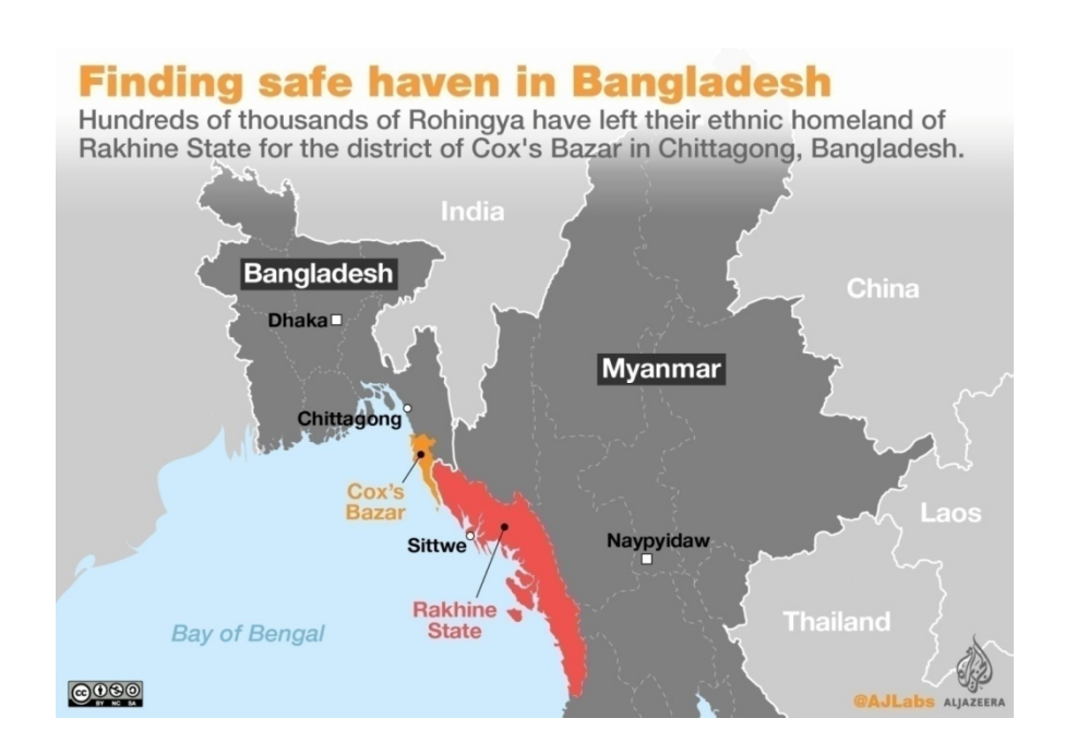
Figure 1: Rakhine state in Myanmar and Cox's Bazar District in Bangladesh

Cox's Bazar District has an area of 2,491.86 km<sup>2</sup>. It is bounded by Chittagong District on the north, Bay of Bengal in the south, Bandarban District on the east, and the Bay of Bengal on the west. Major rivers include Matamuhuri, Bakkhali, Reju Khal, Naf River, Maheshkhali channel and Kutubdia channel.