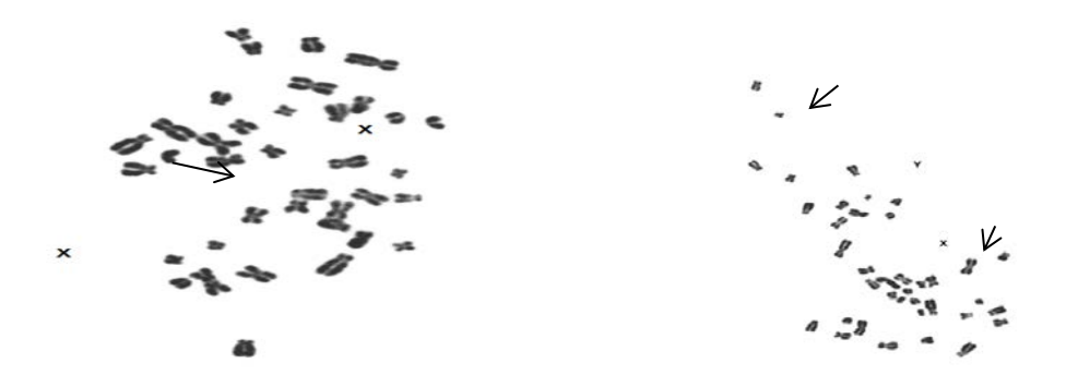
Figure 4: Metaphase of Chimeric tri-colored cat showing 38, XX and 38 XY