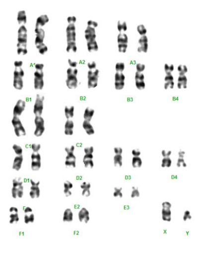
Figure 1: GTG-banded karyotype of domestic male cat